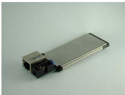
Figure 3: ExpressCard® interface card