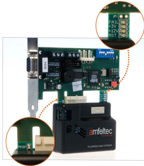
Figure 4: PCI express stabilization tabs