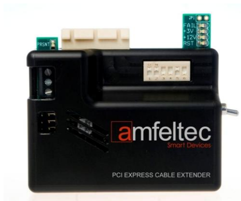
Figure 1: PCI express Cable Extender

The Cable Extender uses a bus switch to connect/disconnect the UUT PCI express card from the host computer without it shutting down. This flexibility minimizes the testing time, protects the host computer from damage and what is new make it possible to move noisy computer out of the way. At the same time, by using connection via ExpressCard® it allows to connect x1 PCI express card via PCI express Cable extender to any laptop.