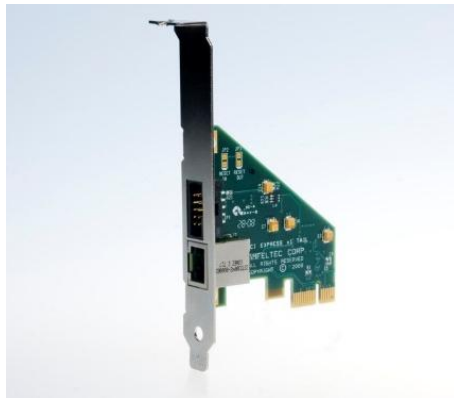
Figure 2: PCI express interface card