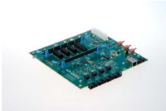
Figure 1: PCI Express Expansion Backplane